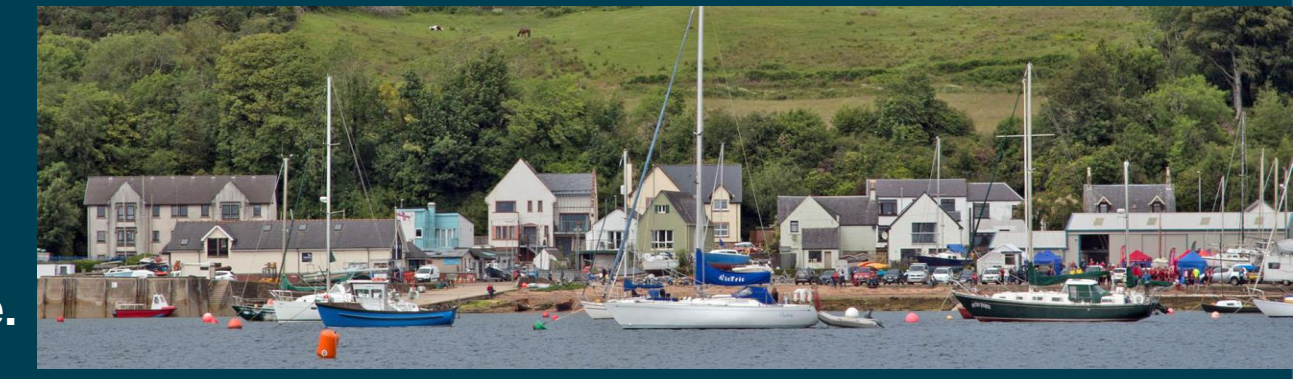
Arran Yacht Club, Lamlash

Marine infrastructure will support key components of the marine-tourism industry such as sailing and boating, paddle sports, marine leisure, and recreation.